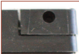
Individual Cell Venting System