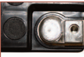
Exclusive Molded Terminal Design

The East Penn AUX Battery is specially designed and uniquely capable to deliver dependable auxiliary support to critical vehicle functions. Premium AGM technological innovation optimizes valve-regulation and recombination efficiency through an individual cell venting system. This ensures unquestionable reliability while maximizing cycling performance. A durable, reinforced case, cover, and terminal design further protect the battery's critical performance in almost any location of the vehicle.